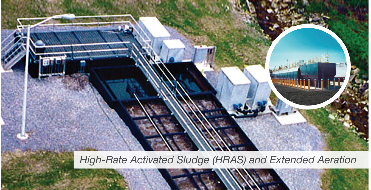
High-Rate Activated Sludge (HRAS) and Extended Aeration