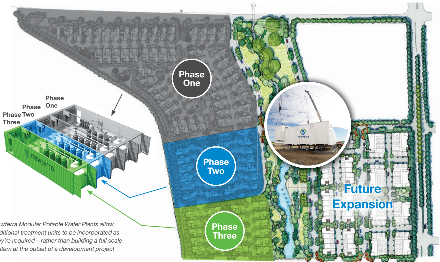
Newterra Modular Potable Water Plants allow additional treatment units to be incorporated as they're required – rather than building a full scale system at the outset of a development project

Rather than constructing a large system at the outset of a development to meet all anticipated future capacity, Newterra's scalable systems allow treatment infrastructure to be added in stages in parallel with capacity requirements. It's a more efficient and cost-effective approach for municipalities and developers – and opens the door to alternative financing models, such as leasing.