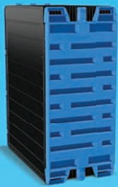
MicroClear® UF Membranes

Modular systems are pre-wired and plumbed with quick-connects to allow installation & commissioning in one day or less.