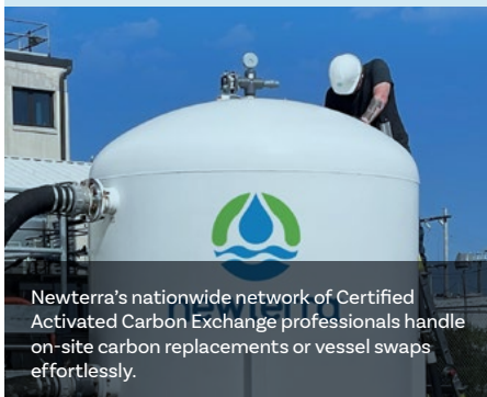
Newterra's nationwide network of Certified Activated Carbon Exchange professionals handle on-site carbon replacements or vessel swaps effortlessly.

Choose Newterra to equip your facility with the right tools and expert support, enabling you to achieve outstanding water treatment results while protecting both the environment and your bottom line.