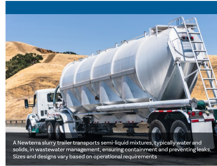
A Newterra slurry trailer transports semi-liquid mixtures, typically water and solids, in wastewater management, ensuring containment and preventing leaks. Sizes and designs vary based on operational requirements

Coconut shell-based Granular Activated Carbon, a virgin granular form of activated carbon derived from selected coconut shell grades, is ideal for liquid phase applications, particularly in removing organics from water streams.