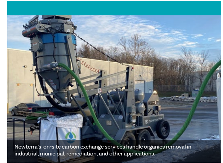
Newterra's on-site carbon exchange services handle organics removal in industrial, municipal, remediation, and other applications.